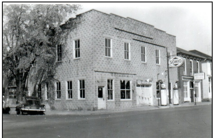
Wentz Brothers building before the remodeling was completed in 1953-1954

The Packer Center is now open by appointment only. Call 937.646.0011 to schedule a private tour.