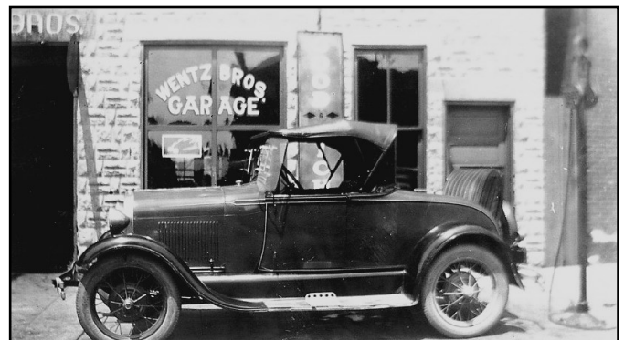
Newly built Wentz Brothers Garage in downtown Anna

As the automobile became more popular, Ferd saw a new opportunity and began servicing and selling new vehicles in addition to helping Elmer with blacksmithing. Their business grew to the point that more space was needed, and the brothers decided to build a new two story building (where Noll Fisher is located today). They built it with concrete blocks they poured themselves. The first story was used as their repair garage, and the second story was used as a body shop. A ramp was built at the back of the building to drive vehicles up to the second story which was a real challenge in the winter.