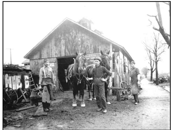
Original blacksmith shop in Anna begun by the Wentz brothers

As the automobile became more popular, Ferd saw a new opportunity and began servicing and selling new vehicles in addition to helping Elmer with blacksmithing. Their business grew to the point that more space was needed, and the brothers decided to build a new two story building (where Noll Fisher is located today). They built it with concrete blocks they poured themselves. The first story was used as their repair garage, and the second story was used as a body shop. A ramp was built at the back of the building to drive vehicles up to the second story which was a real challenge in the winter.