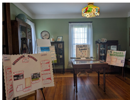
Several of the student projects prior to the open house